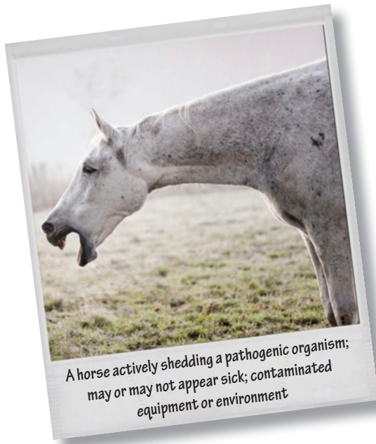
A horse actively shedding a pathogenic organism; may or may not appear sick; contaminated equipment or environment