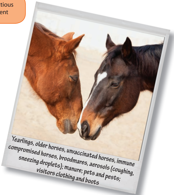
Yearlings, older horses, unvaccinated horses, immune compromised horses, broodmares, aerosols (coughing, sneezing droplets); manure; pets and pests; visitors clothing and boots

Equine diseases use vectors and fomites to enter into an animal or herd that is susceptible to hosting the bacteria or virus. Hosts might not always get sick. Regardless, the host horse or horses then serve as a reservoir of that infectious agent. The infection agent may be passed from horse to horse via vectors (living entity that may carry the organism) or fomites (inanimate objects that carry organisms on their surface). Examples of vectors are: people, dogs, cats, other horses and wildlife. Examples of fomites are brushes, halters, buckets, horse trailers, saddle pads, stall doors etc. The fomites or vector facilitates infectious organisms travel around a premise or community. Without your biosecurity efforts, the cycle continues to spread disease.