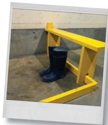
A simple crossover station at the entrance and exit to isolation. Physical barriers serve to remind people to change footwear, outwear and wash hands prior to entering and upon exiting quarantine and/or isolation

Disinfectants require contact time with surfaces to be effective. Check manufacturer's directions.