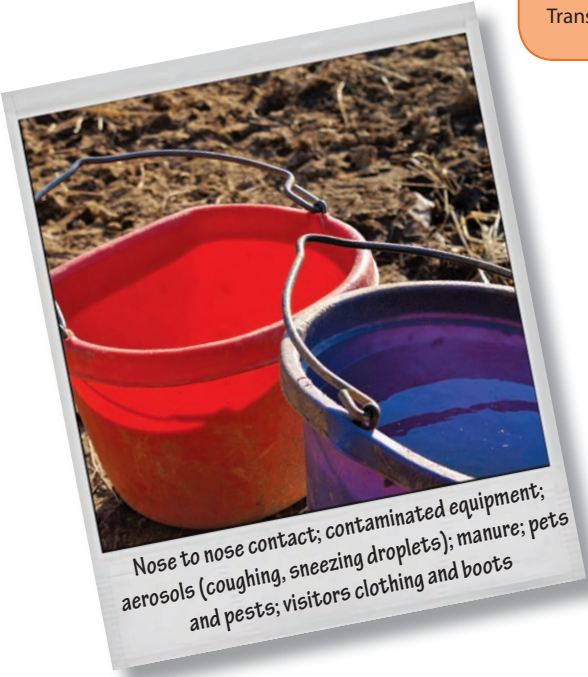
Nose to nose contact; contaminated equipment; aerosols (coughing, sneezing droplets); manure; pets and pests; visitors clothing and boots