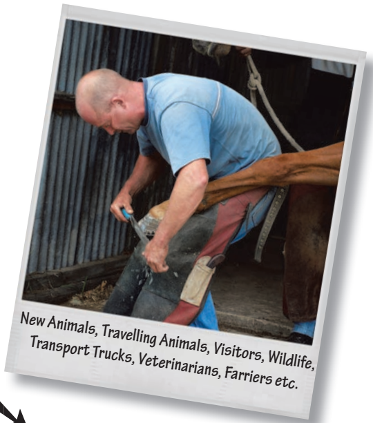
New Animals, Travelling Animals, Visitors, Wildlife, Transport Trucks, Veterinarians, Farriers etc.